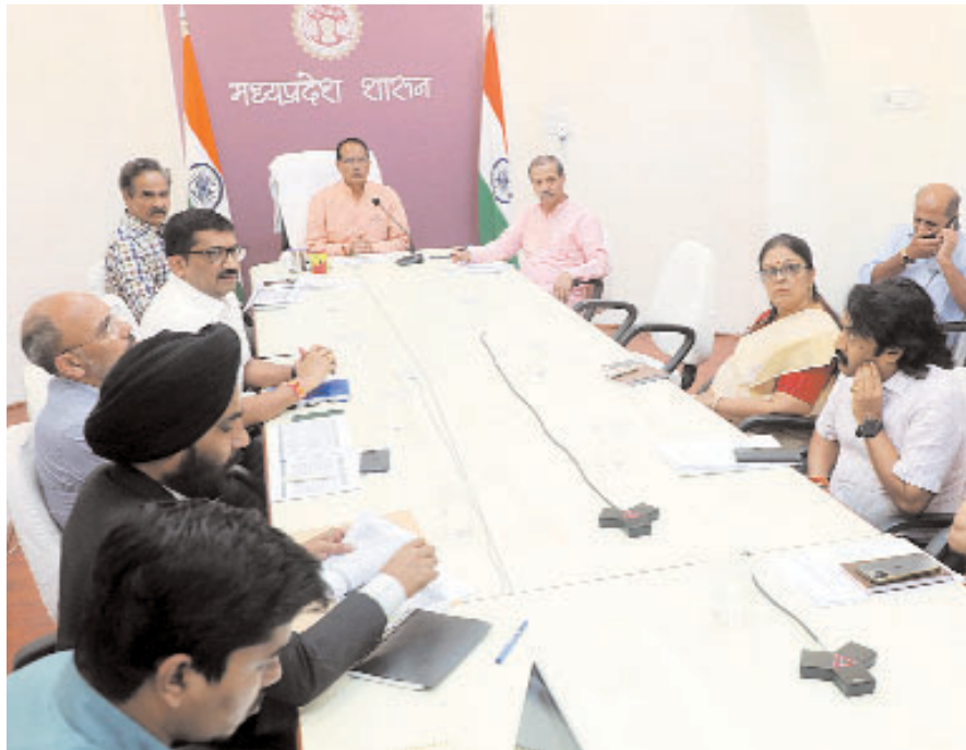
Team Absolute | Bhopal