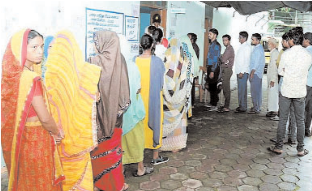
Team Absolute | Bhopal

The elections being held in 46 urban bodies in Madhya Pradesh are small elections, but a big message is hidden in these elections. This is the reason that the ruling party BJP and the main