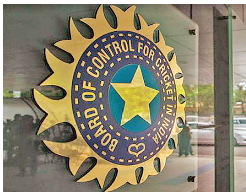
ing a T20 match based on the context of the game," it added.

"The BCCI would like to introduce the concept of 'IMPACT PLAYER' wherein participating teams could replace one member of its playing XI during a T20 match based on the context of the game," it added.