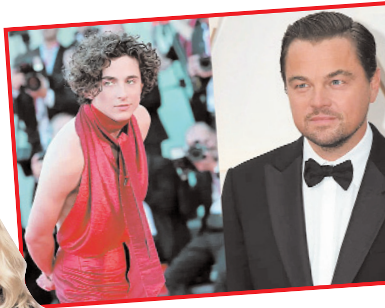
Los Angeles | Agencies

DiCaprio advises Timothee Chalamet against starring in superhero movies