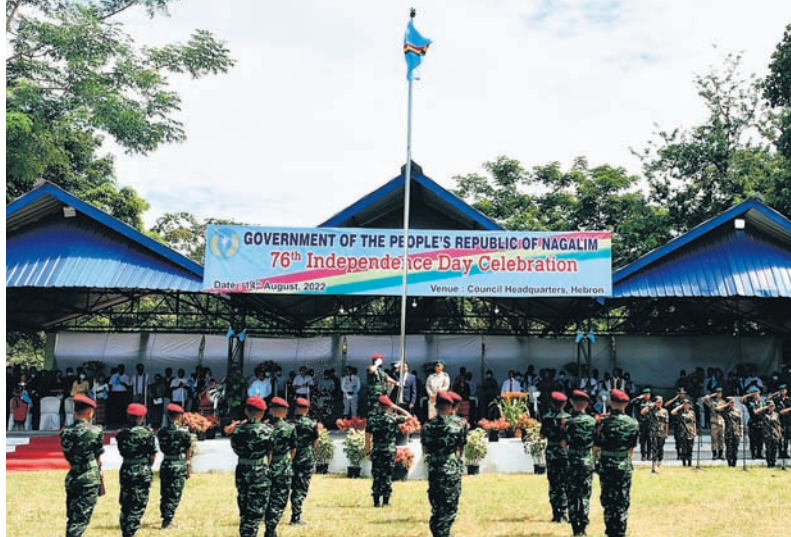
Government of India to make the right move and to fulfil the commitment given to the Nagas." Manipur-based All Naga Students' Association (ANSA) in a separate statement referring to a Manipur government notification said that the blanket

The Naga tribals hoisted the "Naga national flag" and organised programmes in Nagaland and at many villages in the Naga dominated areas of Manipur on Sunday to celebrate the "Naga Independence Day". A considerable number of Naga tribals inhabited in many of the 16 hill districts of Manipur while there are Kuki tribals in these hill districts, bordering Nagaland, Assam, Mizoram and Myanmar. A statement said: "All Nagas unite with one decision, one faith, and one politics on the principle of Nagalim for Christ. The Nagas have endured 25 years of gruelling ceasefire living up to "our commitment for a peaceful solution of the Naga political issue. We have also waited patiently for seven long years after the historic Framework Agreement was signed on August 3, 2015. We have not left any stone unturned of what it takes to bring a solution that is honourable, inclusive, and acceptable to both the Nagas and the Government of India. The ball is now in the court of the