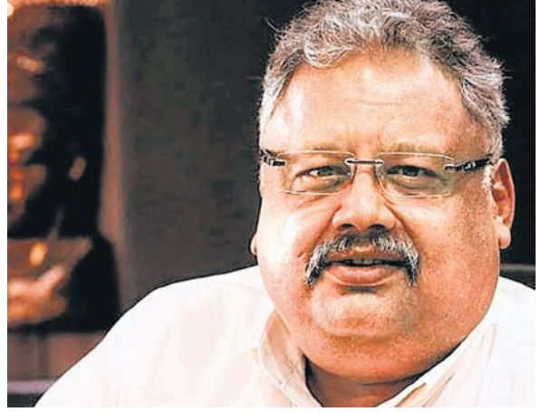
south Mumbai, and had been on the board of several top companies. Jhunjhunwala had an estimated net worth of $5.5 Billion (as of July 2022), which made him the 36th richest man in India. Jhunjhunwala was