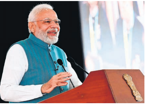
Team Absolute | New Delhi

This Independence Day is likely to witness key announcements including "Heal in India" and "Heal by India" projects in the health sector by Prime Minister Narendra Modi. According to sources, PM Modi's speech from the Red Fort on August 15 may also mention the expansion of the National Health Mission under a new name, "PM Samagra Swasthya Mission". Under the "Heal in India" campaign, the medical infrastructure at 37 institutions in 12